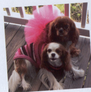
Jez & Bella

Jez, in a multi-stripe sweater ($22, The Pet Set), and Bella, in classic pink tutu by Metro Paws ($20 and up, metropaws.com), get in the spirit of Valentine's Day.